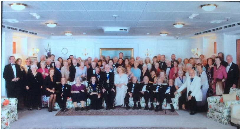
Group photo in State Drawing Room