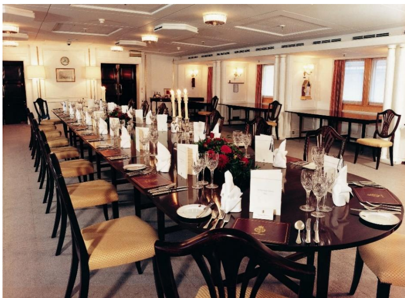
State Dining Room laid up for Dinner